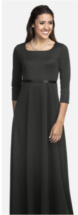
OPTION 1 Empire skirt with large scoop neck – ribbon under bust