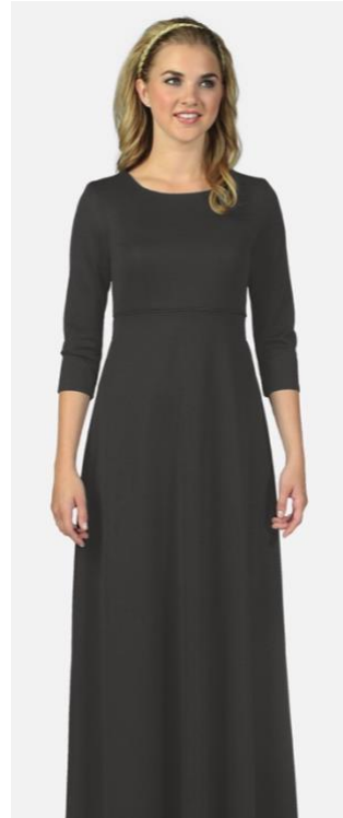
OPTION 2 Empire skirt with round neck - piping under bust