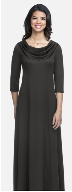
OPTION 6 Princess skirt w/ cowl neck – seaming in front