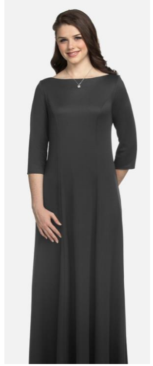
OPTION 5 Princess skirt w/ boatneck – seaming in front