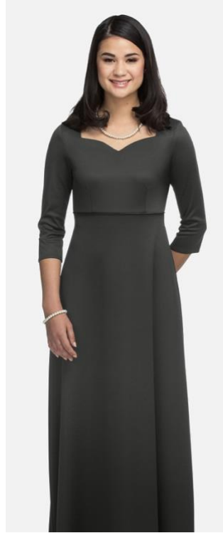
OPTION 3 Empire skirt with sweetheart neck – piping under bust