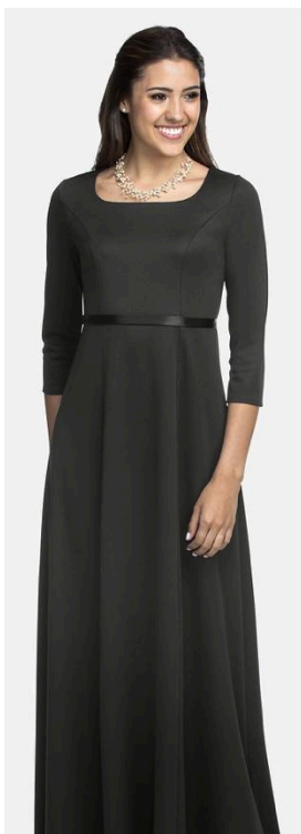
OPTION 1 Empire skirt with large scoop neck – ribbon under bust