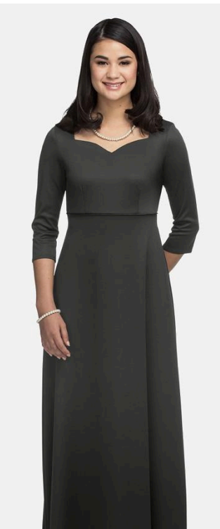
OPTION 3 Empire skirt with sweetheart neck – piping under bust