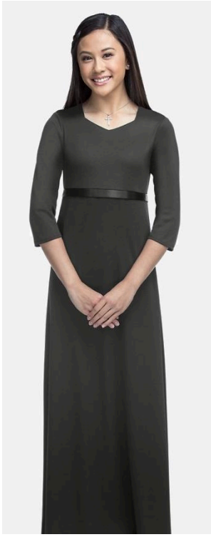
OPTION 4 Empire skirt w/ square sweetheart neck – ribbon under bust