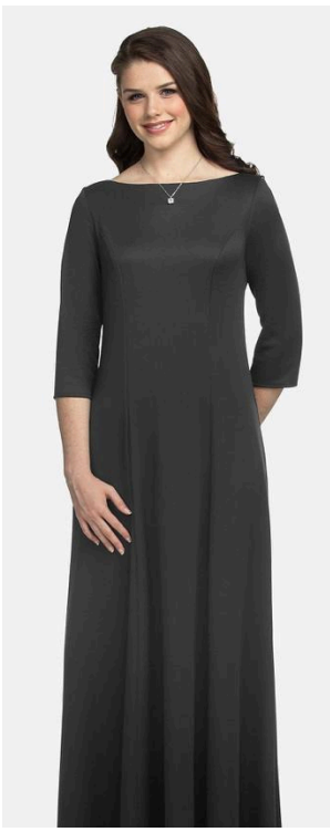
OPTION 5 Princess skirt w/ boatneck – seaming in front