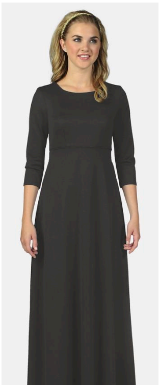
OPTION 2 Empire skirt with round neck - piping under bust