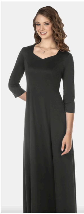
OPTION 6 Princess skirt w/ sweetheart neck – seaming in front